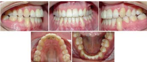
Fig. 8: post treatment intraoral photographs

The teeth were retained using a bonded 0.0195 twist flex wire from maxillary lateral to lateral incisors (the patient refusing to restore the central incisor at that time) and from mandibular canine to canine. In addition, clear vacuum-formed removable retainers were delivered for a night-time use.