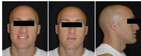
Fig 7: posttreatment facial photographs