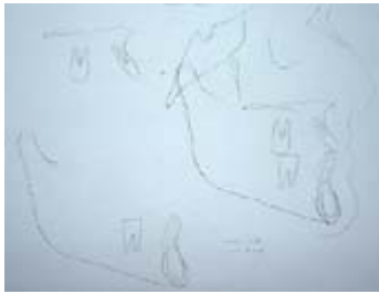
Fig 10: Superimposition of the pretreatment and the posttreatment cephalograms