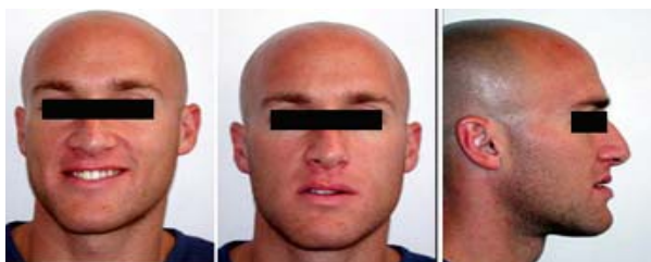
Fig 1: pretreatment facial photographs