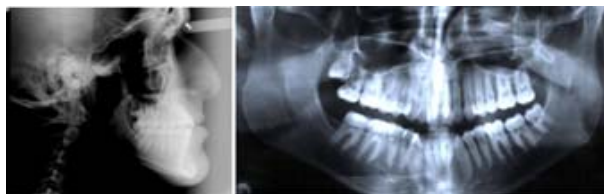
Fig. 3: Pretreatment panoramic and cephalometric radiographs

The intra-oral examination revealed an Angle's Class III malocclusion with 1 mm overjet and overbite. Both upper and lower midlines were shifted to the right relative to the face (1.5mm for the upper midline and 2.5mm for the lower one). An anterior crossbite was present in the area of both lower canines with their antagonist. Both arches were symmetric but not complimentary. The upper arch form was ovoid and more constricted than the lower arch form which was square (Fig 2).