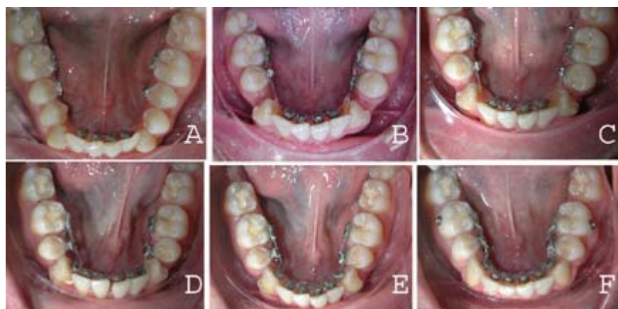
Fig. 5. alignment and leveling of lower arch

In the lower arch all teeth were bonded except first premolars, because of the future extractions, second molars, which were not needed for anchorage, and the canines which could not be bonded due to their malalignment (Fig 5A).