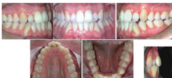
Fig 2: pretreatment intraoral photographs