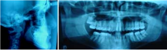
Fig. 9: Pretreatment panoramic and cephalometric radiographs