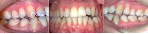
Fig. 6. Frontal intraoral view during lower canines rotation

The four lower incisors were leveled separately from the posterior teeth, using a section of 0.0175 inch Respond (Ormco) wire. On each side, the brackets of the second premolar and the molar were placed on the same horizontal level to enable the insertion of a rigid arch wire, 0.016x0.022 inch Stainless Steel, thus creation a consolidated anchorage unit for retraction of both cuspids. This was performed after the extraction of the first premolars, three weeks after the initial bonding. Clear plastic buttons (Unitec co) were bonded to the labial surfaces of the canines and an elastomeric chain stretched first between them to affect simultaneous derotation and secondly to the posterior teeth for the retraction. (Fig 5 B-C, Fig 6)).